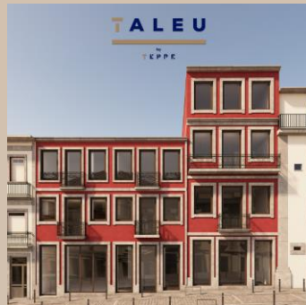
14 Residential Units