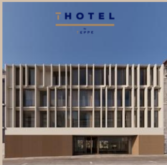
85 Rooms – 4 Star Hotel