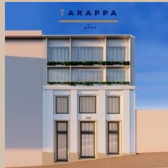
4 Unit Touristic Apartment