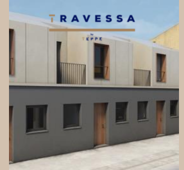
3 Unit Villas