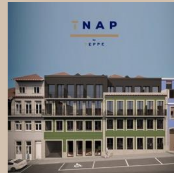
26 Serviced Apartment