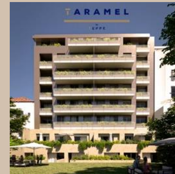
41 Serviced Apartment