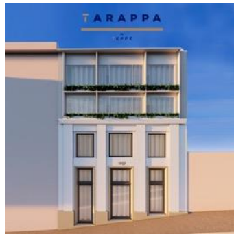
4 Unit touristic apartment