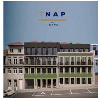
26 Serviced apartment