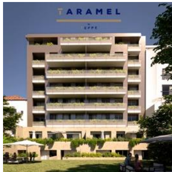
41 Serviced apartment