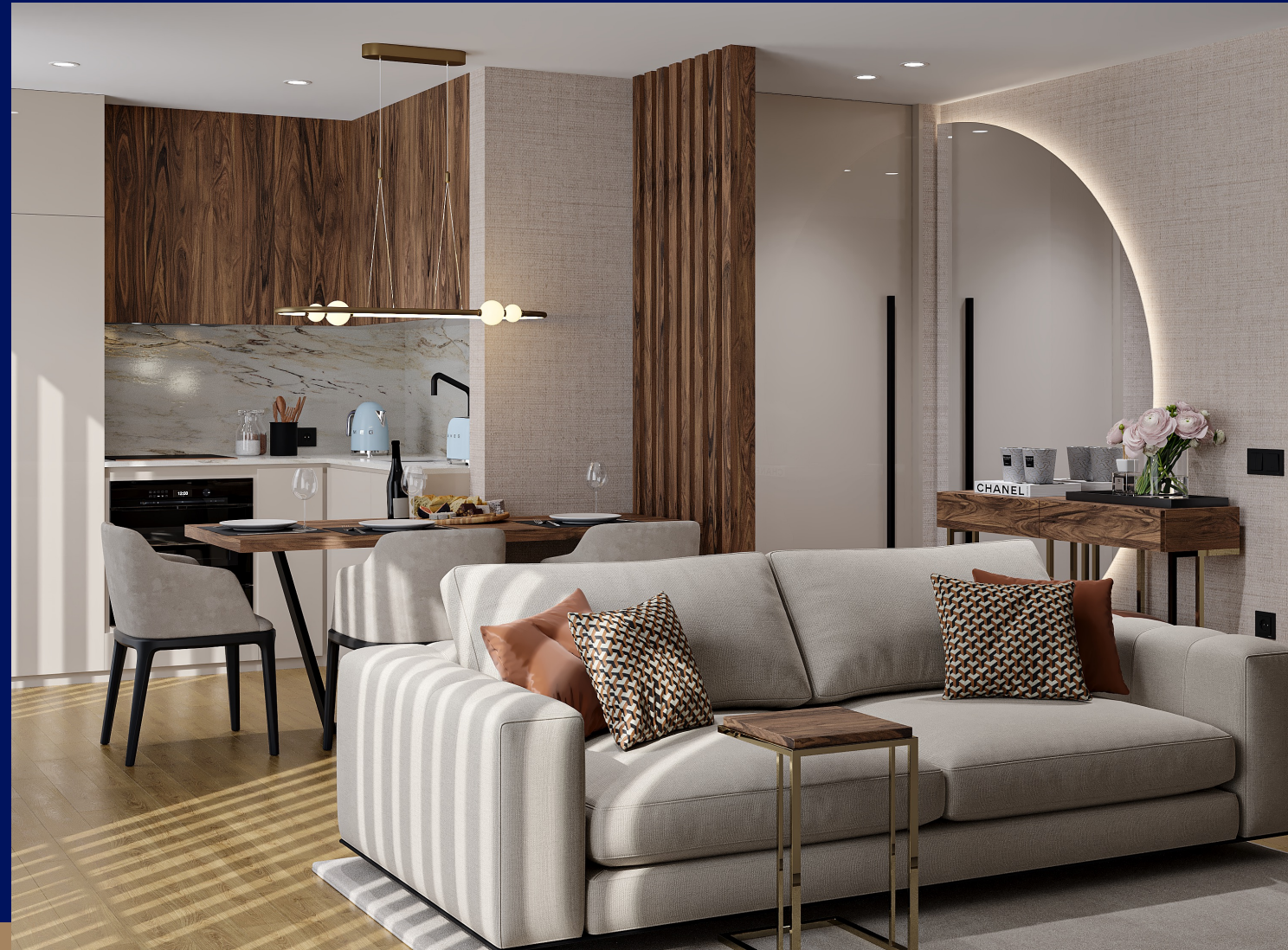
One bedroom apartments | 45 sqm